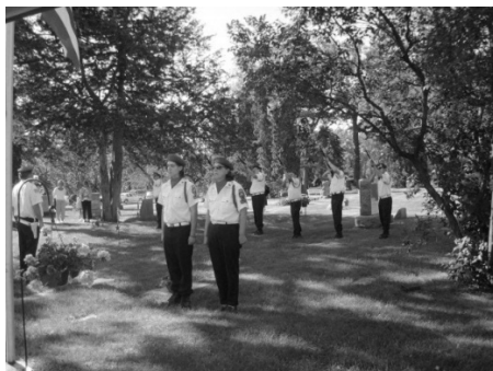
Excelsior American Legion