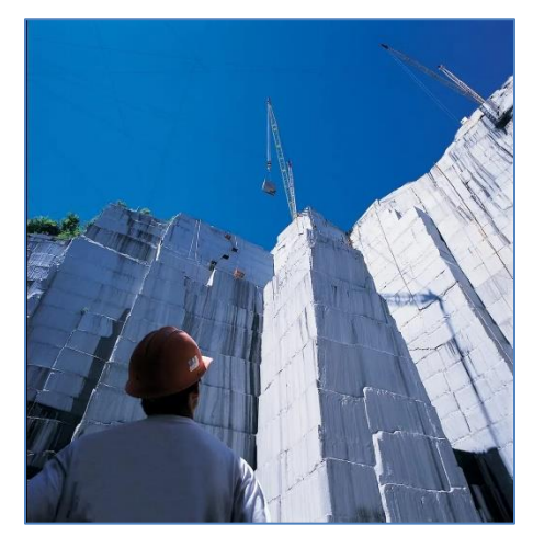
Quarry location unknown

have mostly transitioned over to Pearl Gray (or Twilight), an almost white granite.