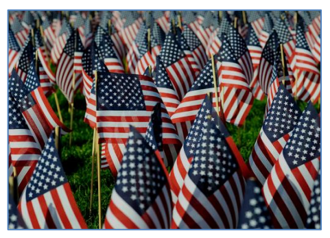
Her parents are also buried at Groveland.