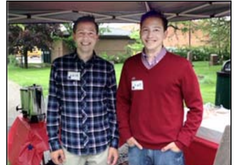
The Twins, Age 24 – 2015

They have fun and bring their enthusiasm and fun spirit every year.