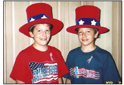
The Twins, Age 12 – 2003